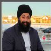
Hon. Jasraj Singh Hallan, MP Shadow Minister for Finance