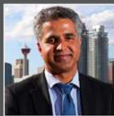
Hon. Irfan Sabir, MLA Official Opposition Deputy House Leader