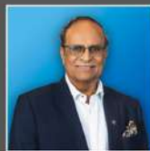
Hon. Muhammad Yaseen, MLA Minister of Immigration and Multiculturalism